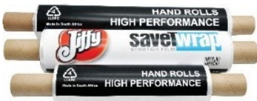
HIGH PERFORMANCE HANDWRAP

An extensive range of widths and micron providing a customised wrapping solution