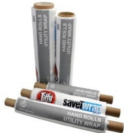
UTILITY WRAP HANDROLLS

Our most popular hand wrapping solution available in extended core only